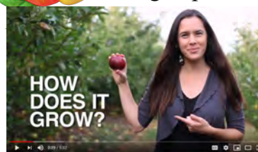
APPLE: How Does it Grow?