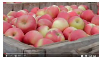
Growing Maine—Treworgy Family Orchards