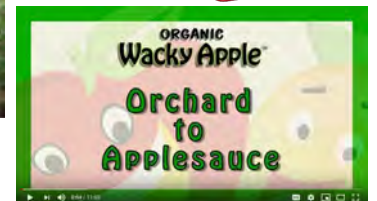
Wacky Apple Educational Video